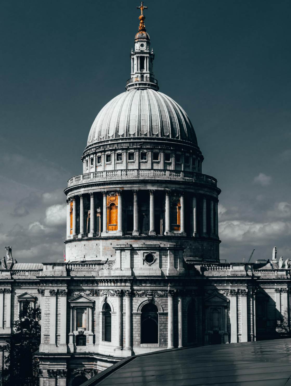
St Paul's Cathedral, London