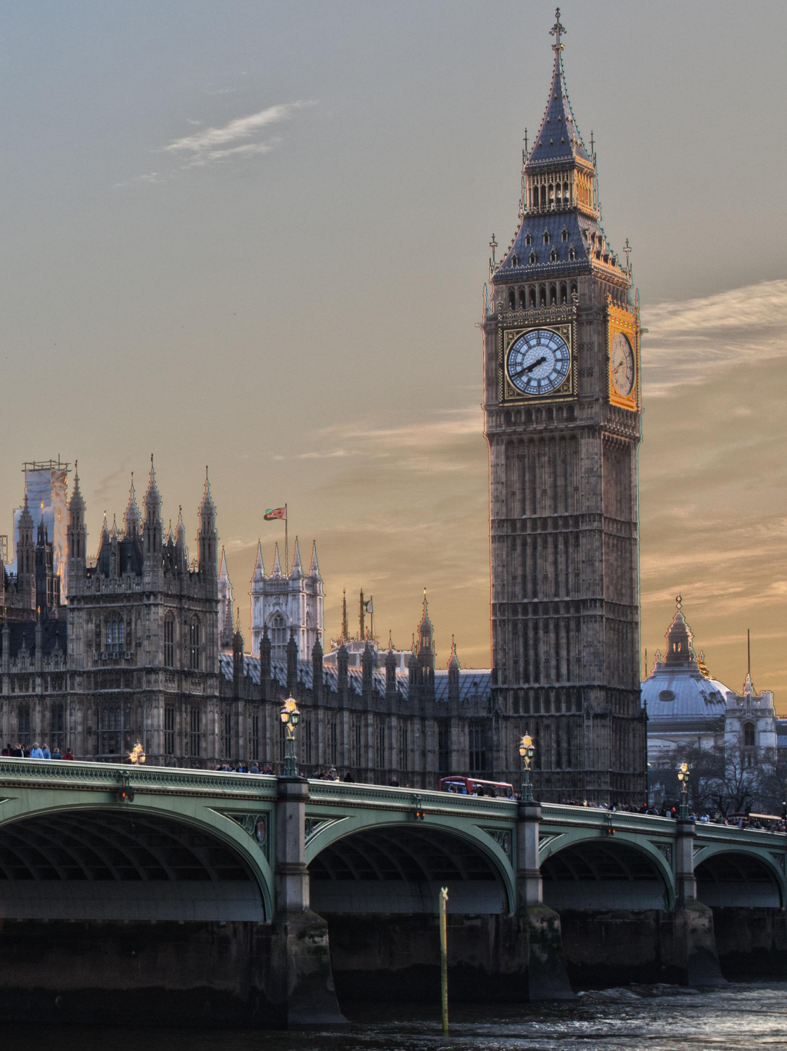
The Elizabeth Tower and Westminster Bridge, London