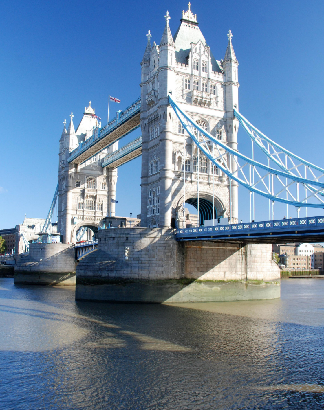
Tower Bridge, London